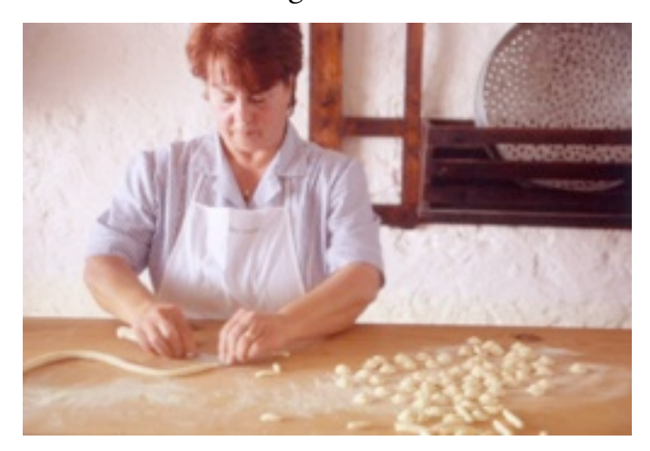
Saturday -Castel del Monte

Continental Breakfast Depart for Sorrento to Start the Second Half of our Sojourn En Route , Visit the Unique Castel del Monte Visit Marchesa Antinori's - Tenuta Bocca di Lupa Estate for Lunch and Wine Tasting Transfer to our Accommodations in Sorrento Dinner at L'Antica Trattoria, Sorrento